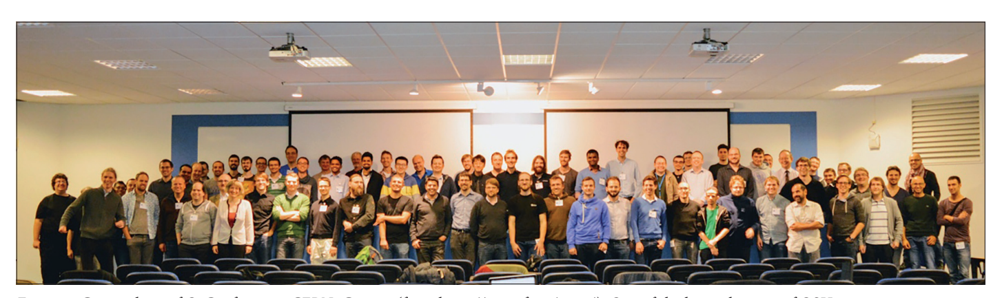
Figure 2: Group photo of OrConf2015 in CERN, Geneva (from https://orconf.org/2015/). One of the key milestones of OSH.

At around the same time RISC-V started to have a noticeable impact. Developed by UC Berkeley, on its own RISC-V is not directly OSH. But the instruction set architecture (ISA) provided a contract between the software and the underlying hardware that was fresh, clean and was made openly available. A well accepted ISA is impor-