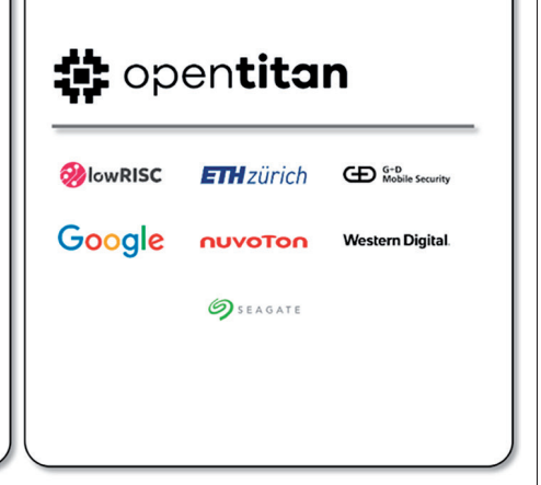
Figure 3: Major industry backed open source initiatives and their backers as of November 2020.